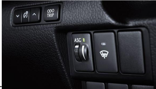
Audi ASC control

Others, such as some models from BMW, will require a bypass harness that will eliminate the unwanted fake engine sounds. On this type of system, the audio from the head unit is sent to the engine enhancement module before it gets sent to the amplifier. Simply unplugging the module will eliminate all audio in the vehicle and trigger an error code. The bypass harness keeps the ASD module powered up and the OEM computer happy. Check with an Authorized KICKER Dealer for details.